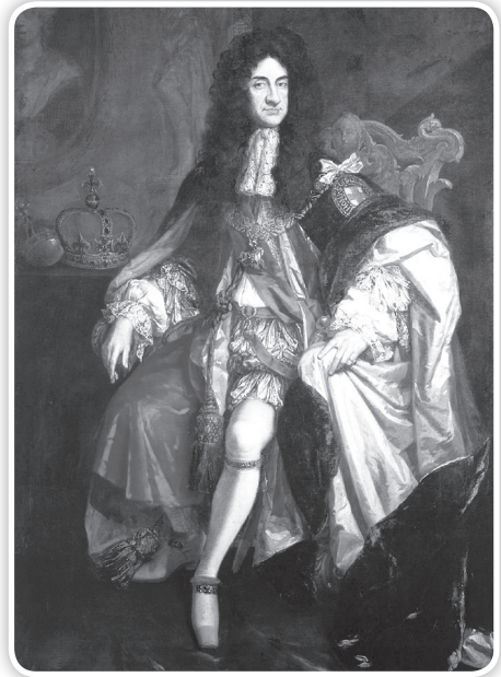
Charles II of England 1685, Godfrey Kneller